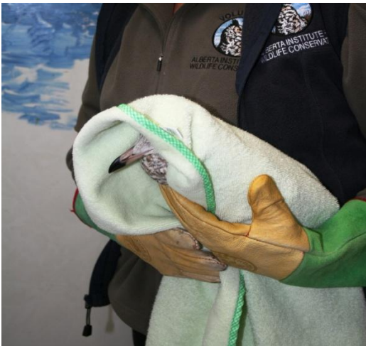
Figure 5: Correct restraint of waterfowl