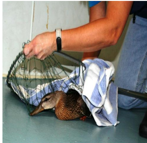
Figure 4b: Removing bird from net