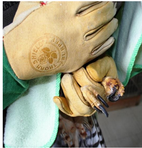
Figure 6: Correct restraint of raptor feet