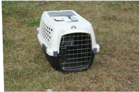
Figure 2: Pet kennel