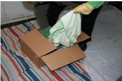
Figure 7: Remove capture towel from box, applying light pressure on bird's back to keep it immobilized

Safety note: The handler in these illustrations is not wearing appropriate safety gear for the capture of oiled wildlife. The photos are for illustration purposes. Please ensure proper PPE as needed.