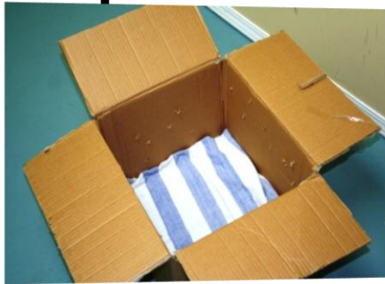
Figure 1: Prepared cardboard box