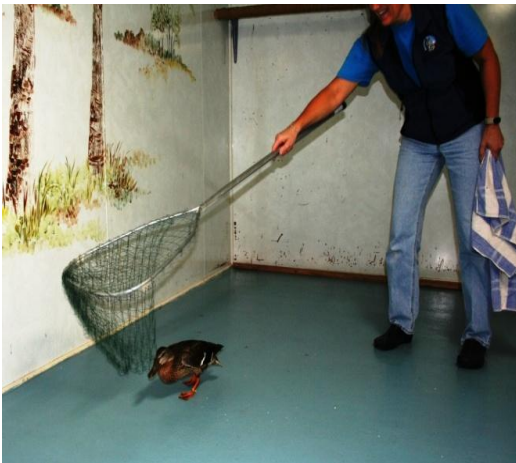
Figure 4a: Using a fish net to capture active birds