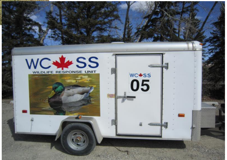
Wildlife Response Unit