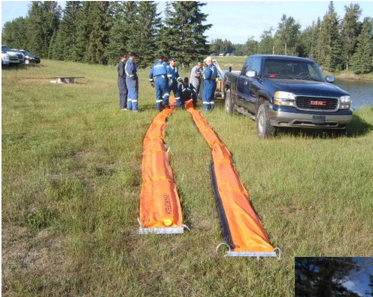
Inflatable River Boom