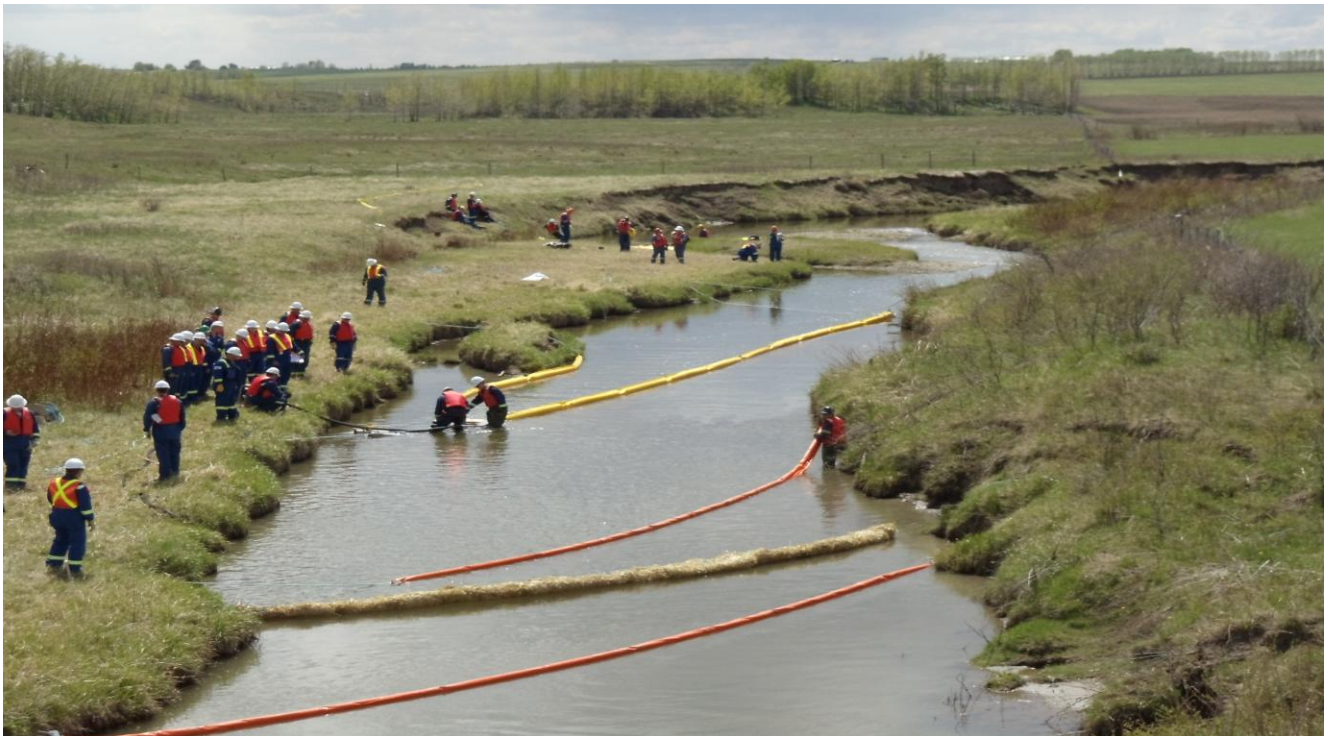
Oil Spill Equipment Deployment

The newest program is the oil spill equipment deployment course designed for companies on an in-house basis. We have qualified instructors that work with a company's field personnel to deploy oil spill containment and recovery equipment in a small watercourse. At the end of the course students will be able to successfully contain and recover oil in smaller creeks and rivers. Attendees will also be in a position to effectively conduct an initial spill response on a larger river until subject matter experts arrive.