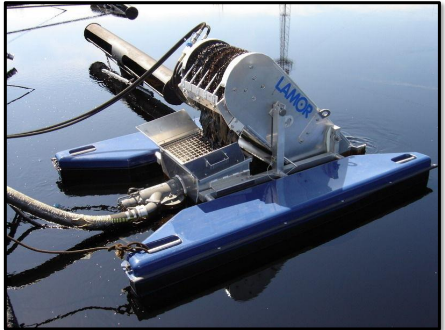
Heavy Oil Skimmer

In addition to the new skimmer WCSS purchased we replaced a jet boat in Grande Prairie and the regional spill response unit in Lloydminster. The air curtain incinerator upgrade was also completed in 2013.