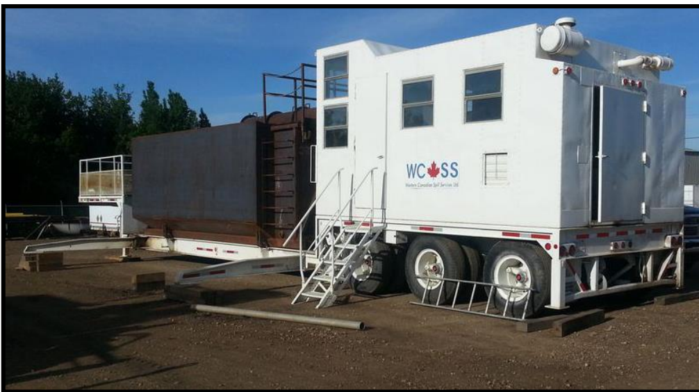
Air Curtain Incinerator

Another highlight of the year was a generous donation of oil spill containment boom and other assorted materials from Canadian Natural Resources Limited; the donated equipment is available to all of our members and is much appreciated; thanks CNRL!