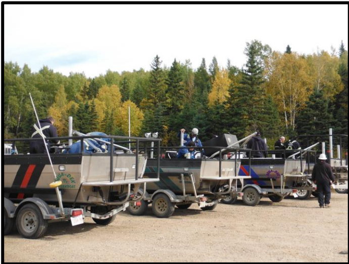
Boat Handling - Recertification